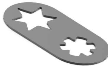
A9 Nut Spanner For A9 Installation Part Number: TM 3117