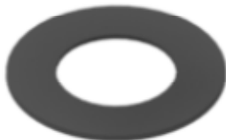
Washer - The raised ring on the washer must face the fabric